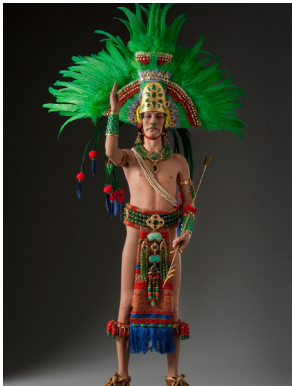
Montezuma II v.2