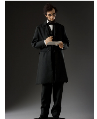
President Abraham Lincoln at Gettysburg 1863