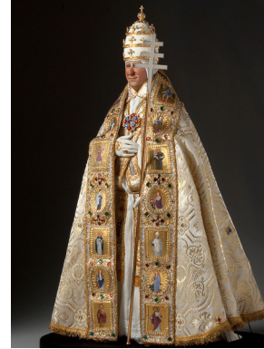
Pope Alexander VI 1492