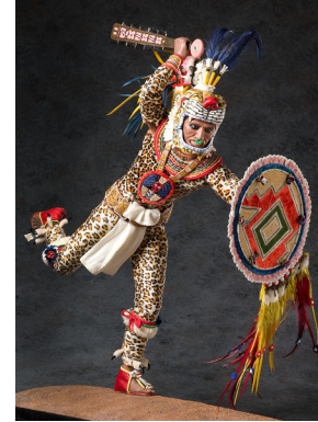
Aztec Leopard Warrior v.2