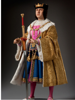
King Ferdinand 1492