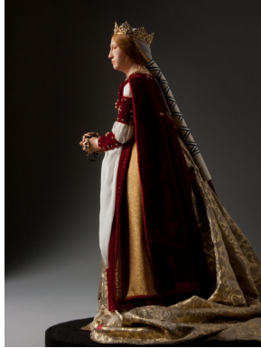
Queen Isabella 1492